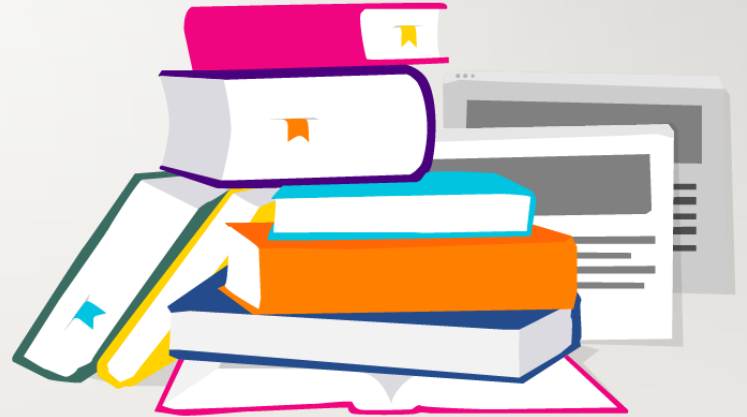
Image by Studio GOOD Berlin, Creative Commons Attribution-Share Alike 4.0 International license.