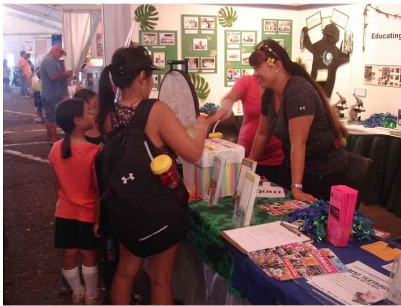
Photo of me sharing with a community member about UH Maui College programs and services. I engaged the public by having people sign-up the Spin-the-Wheel game.