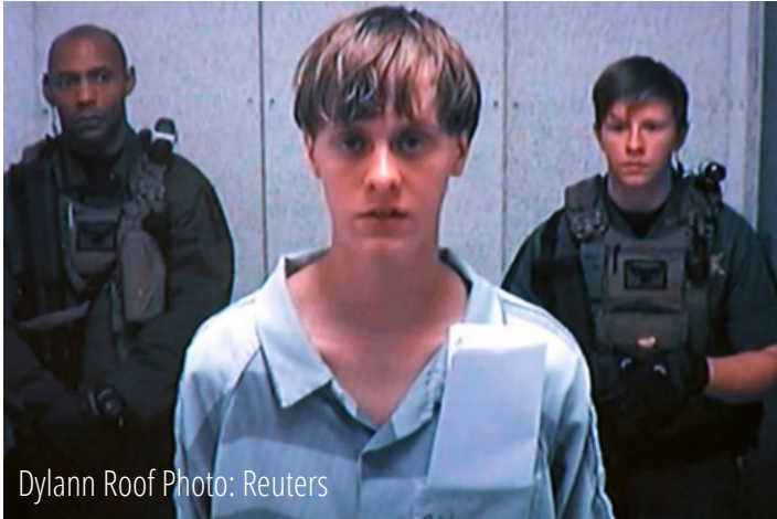
Dylann Roof

www.reuters.com/article/2015/06/20/us-usa-shooting-south-carolina-friends-idUSKBN0P008D20150620